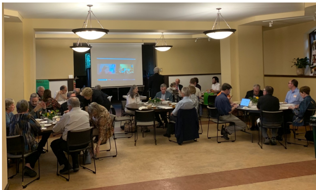
Members at the Annual Meeting are finishing dinner as a Zoom link to include remote participants is set up. Board meetings have been held by Zoom for a couple of years.